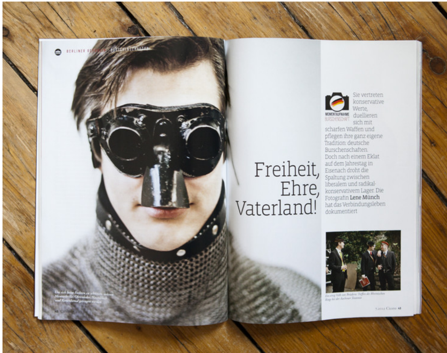
Fraternities in Germany