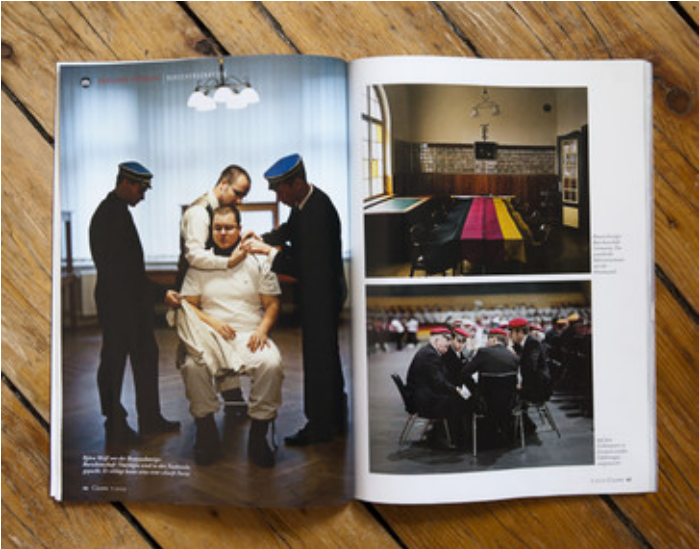
Fraternities in Germany