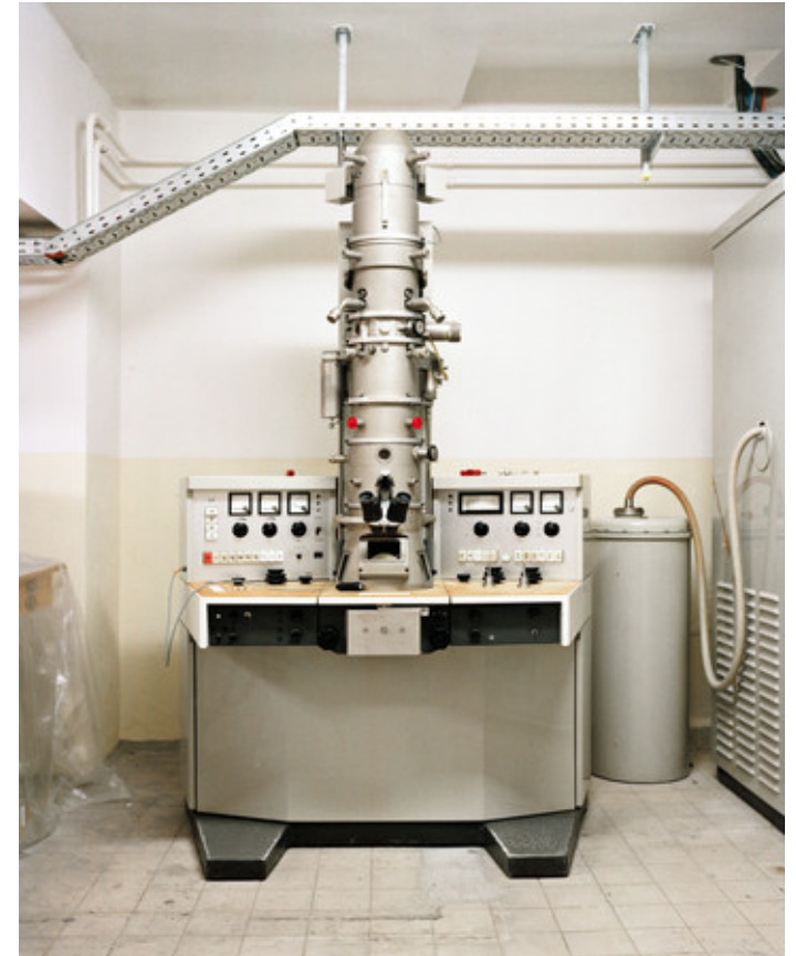
On the small island of Riems in the Baltic Sea the Friedrich-Loeffler-Institute (FLI) is researching highly contagious animal diseases