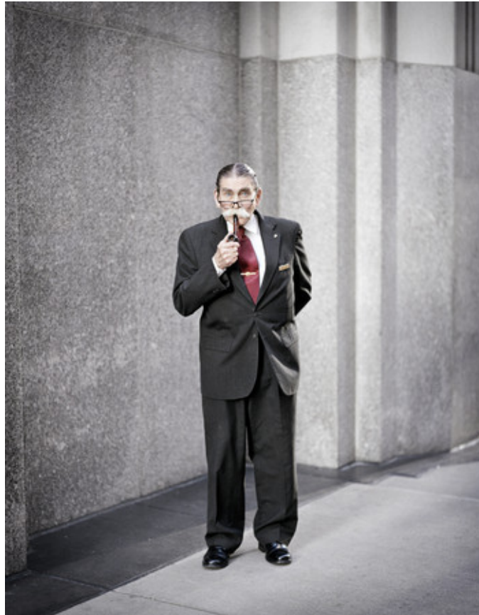
New York City, NY