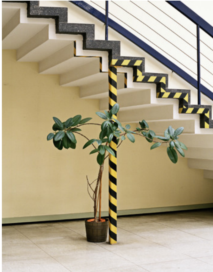
Europäisches Patent- und Markenamt, Berlin

LANDSCAPE / TRAVEL / ARCHITECTURE / STILLS / PORTRAIT / PEOPLE / EDITORIAL / CORPORATE / SCIENCE / HEALTH / EVENT PHOTOGRAPHY / MULTIMEDIA