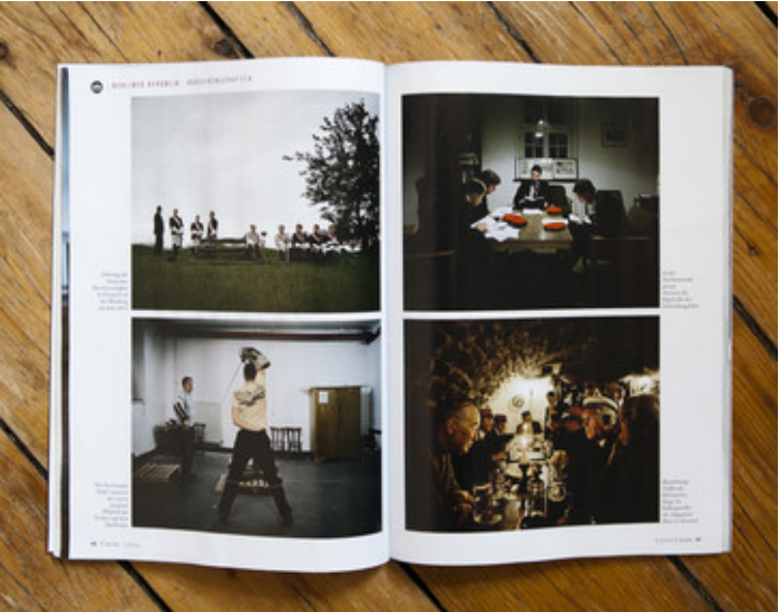
Fraternities in Germany