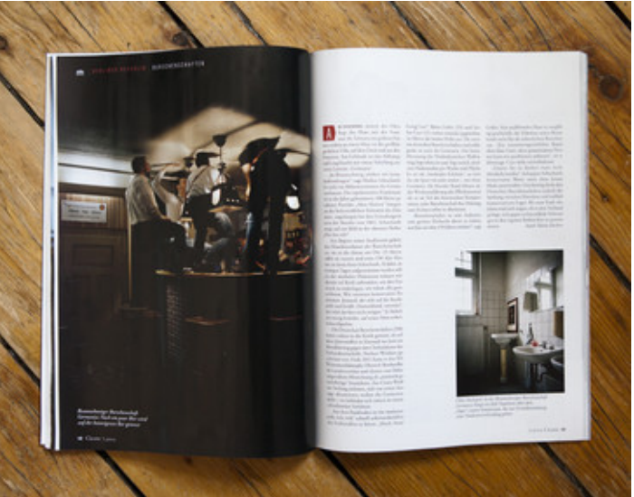
Fraternities in Germany